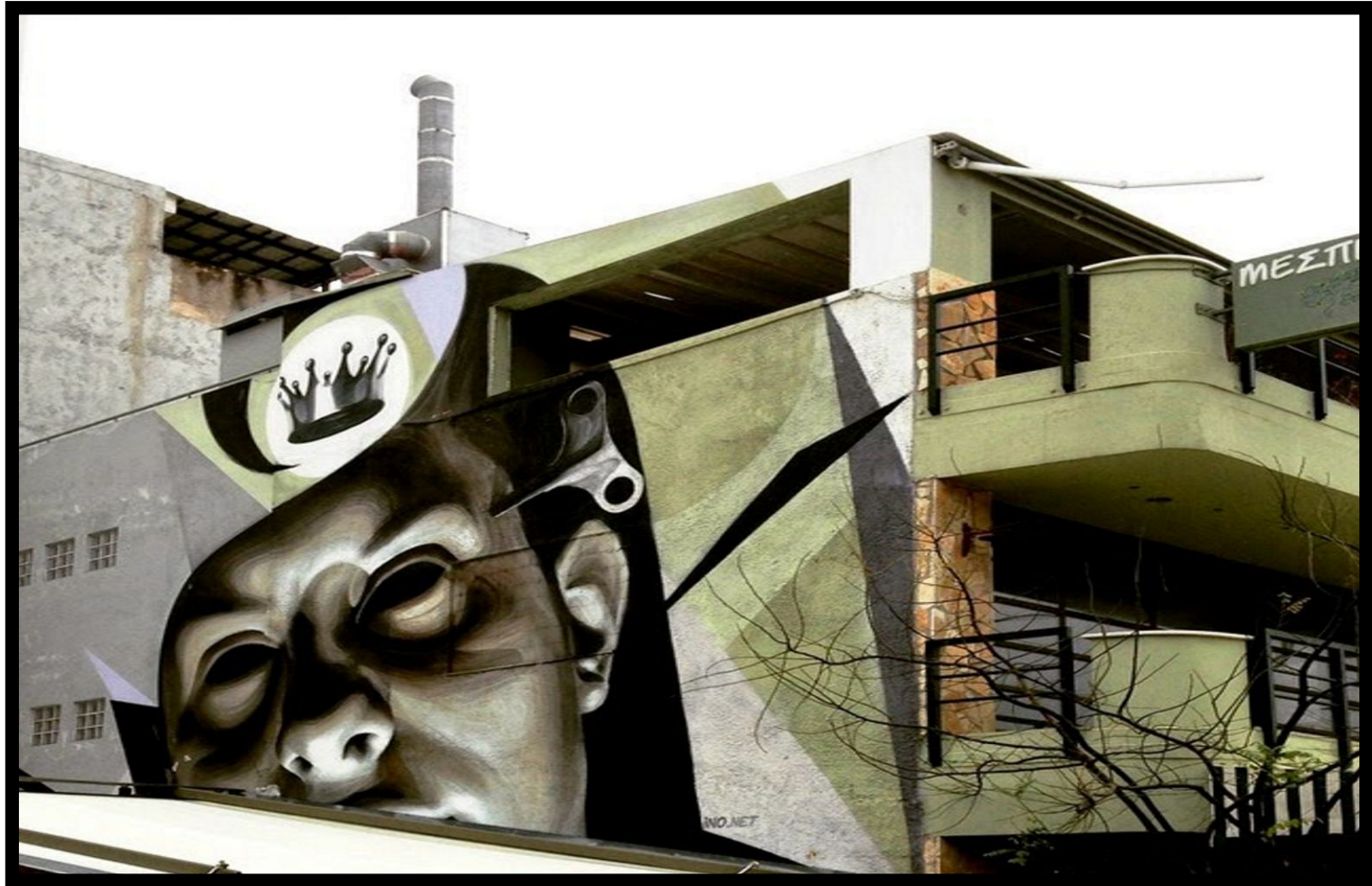
"Clockwork" Gazi district Street Art by INO