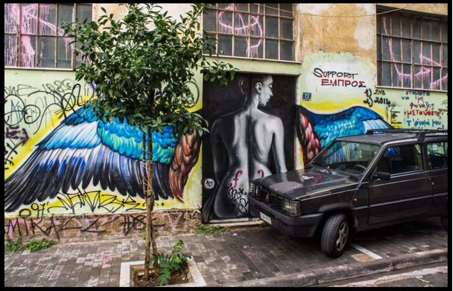
“An Angelic figure” Street Art by WD (Wild Drawing)