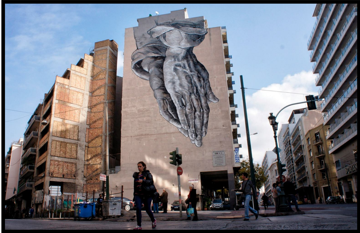
“Praying Hands”, Piraeus street district Street Art by Pavlos Tsakonas (based on Albrecht Dürer’s homonymous drawing)