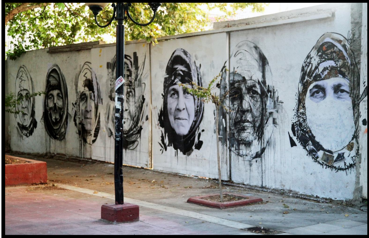
“Village women’s faces of a recent past” Metaxourgeio district Street Art Portraits by Borondo