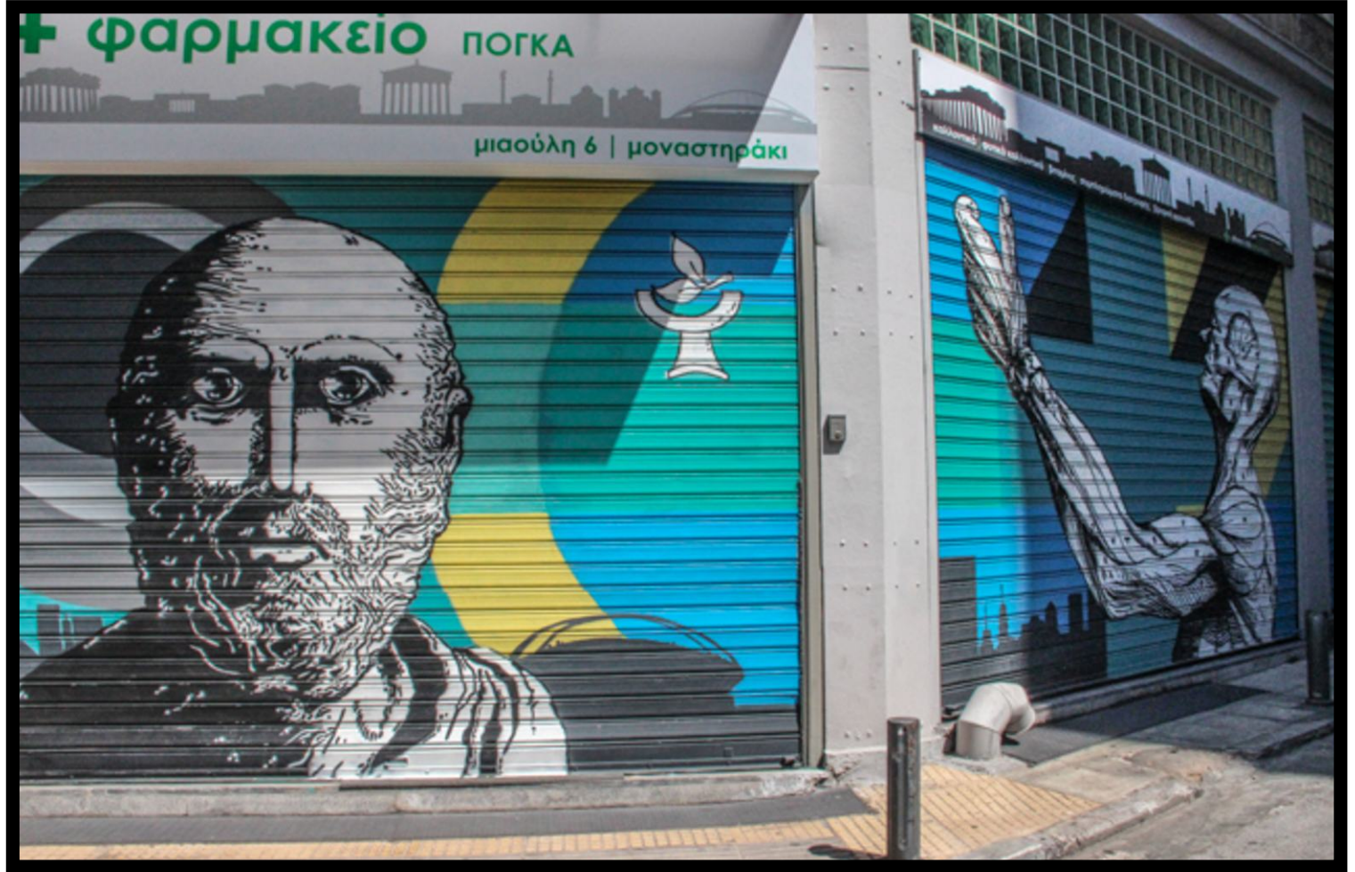
“Ancestors Wonder” Street Art by unknown artist