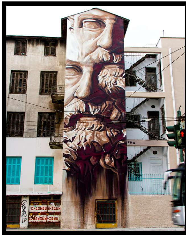
“System of fraud” Metaxourgeio district Street Art by INO