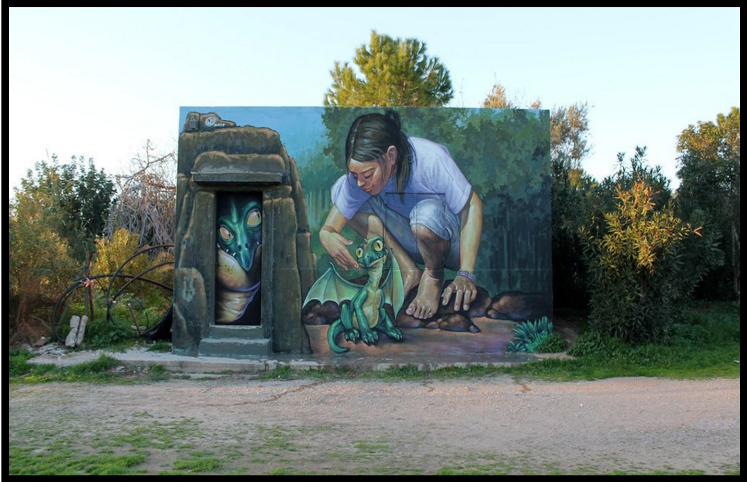
“Untitled” Plato’s Academy Park Street Art by WD (Wild Drawing)