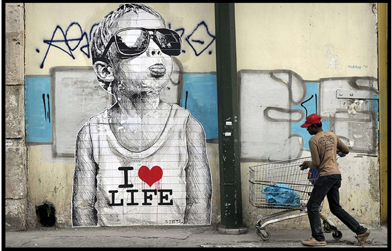
"I love life" Street Art by STMTS