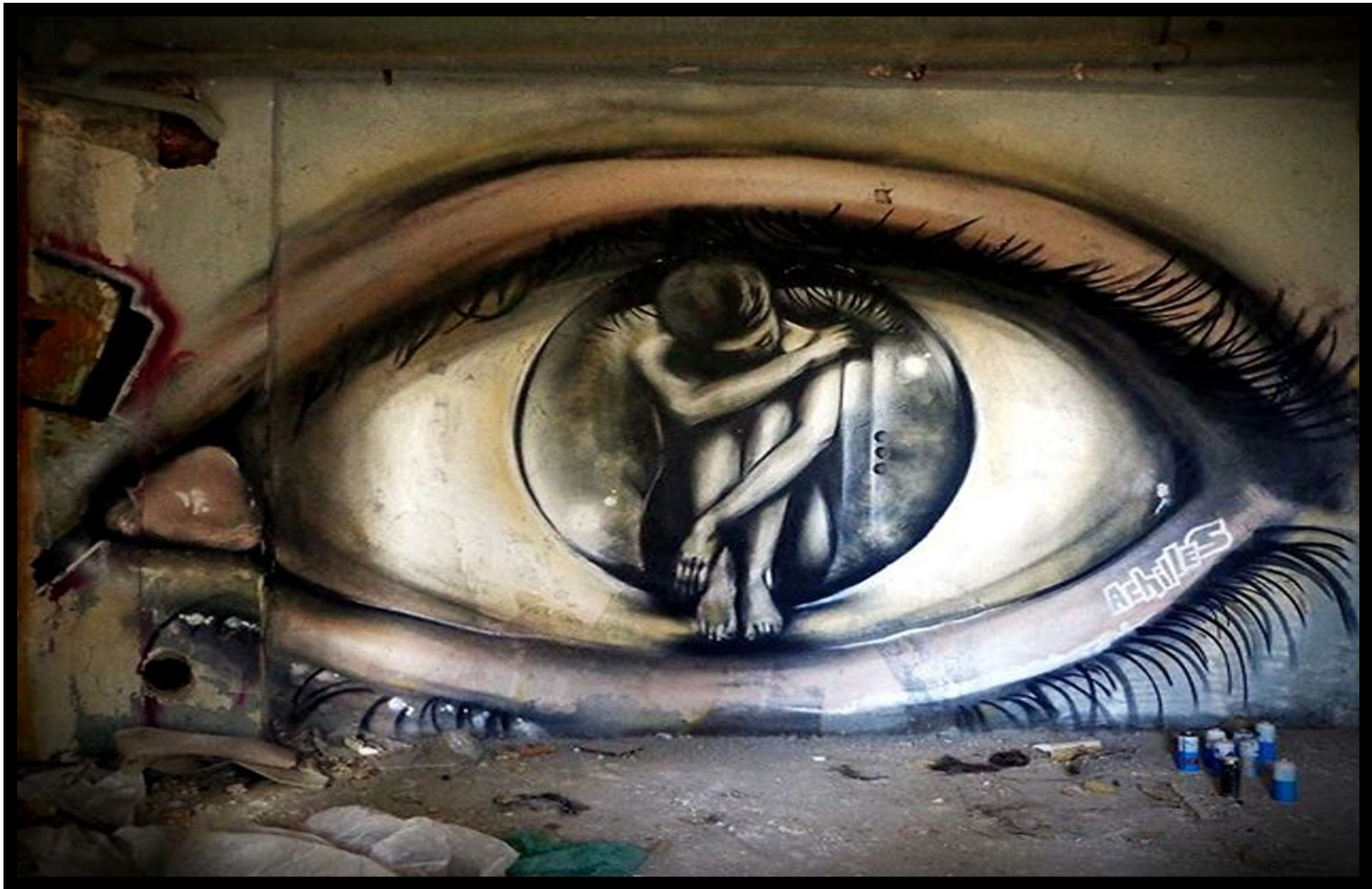
"A human tear" Street Art by Achilles