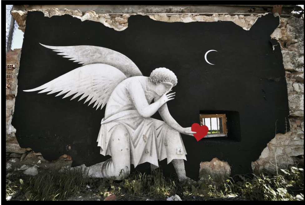
“Wasted love”, Street Art by Antonios Fikos

Wednesday, 2nd of December 2015 Residence of Greece Canberra