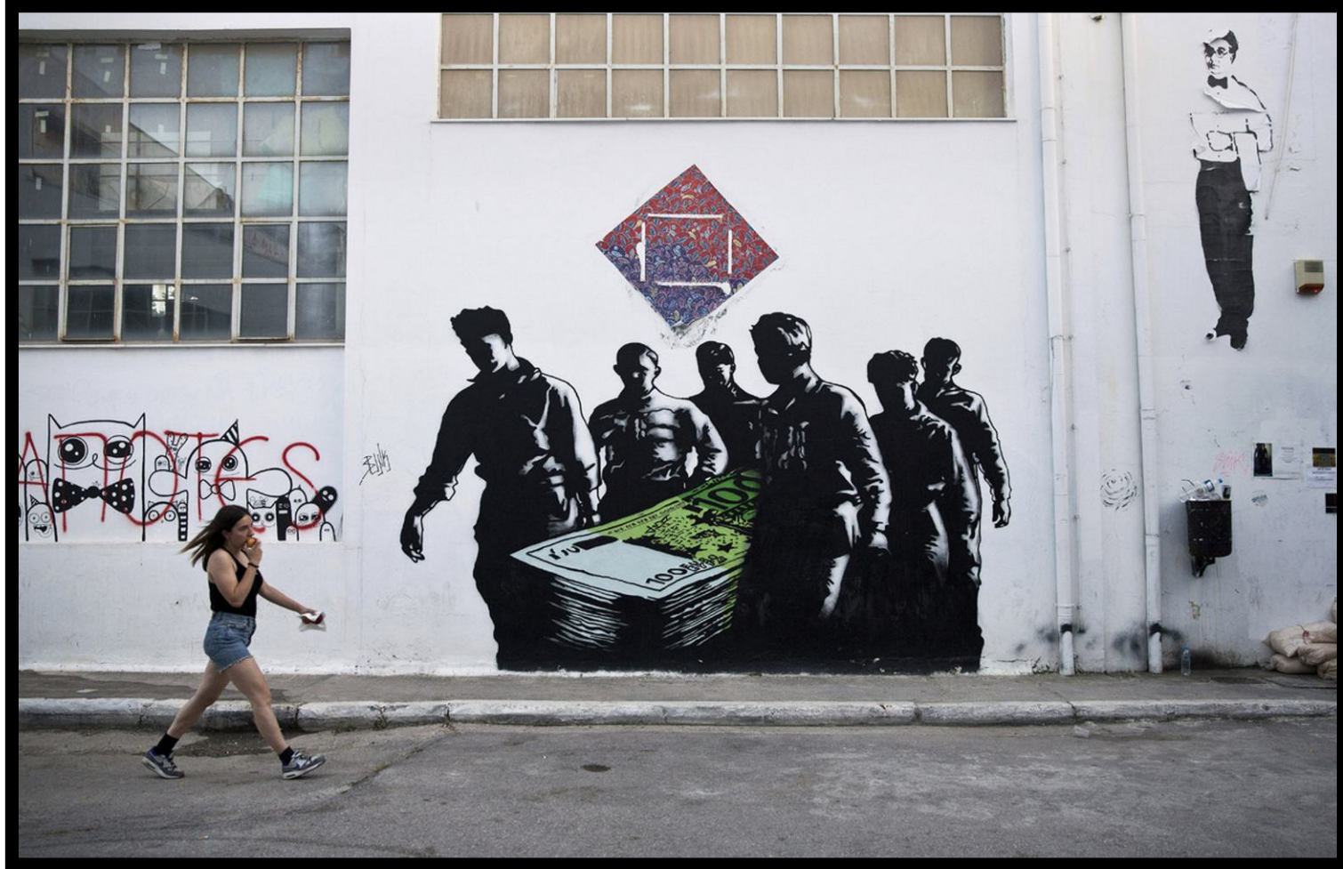
“Death of Euros” by French artist Goïn