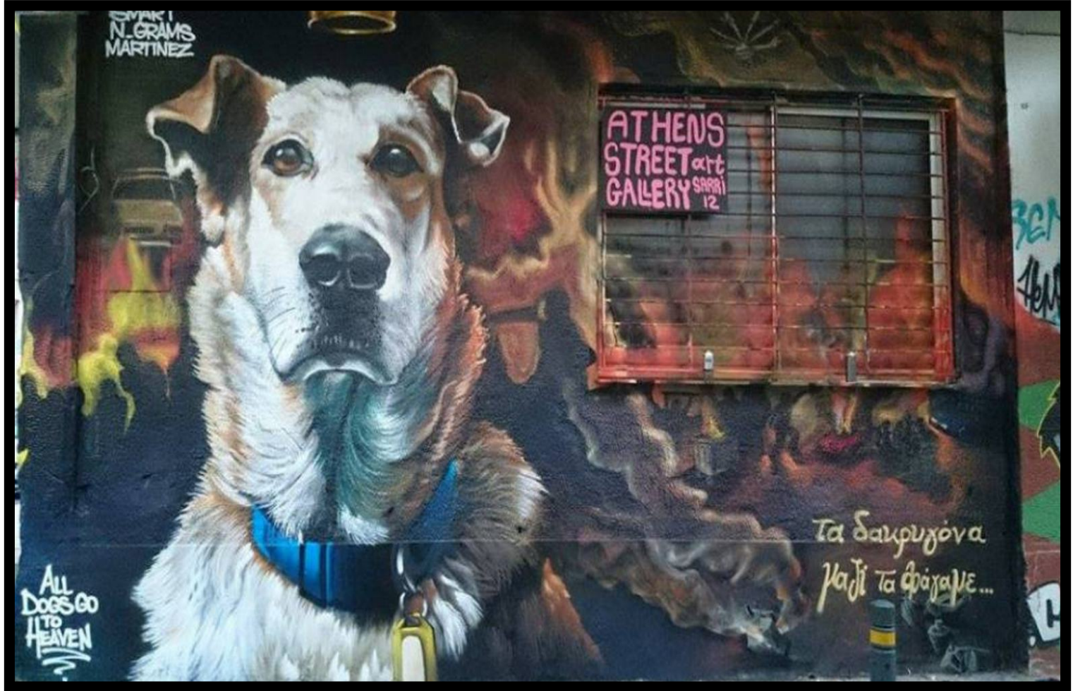
"All dogs go to Heaven - We ate together the tear gas" Street Art by SMART N. GRAMS MARTINEZ