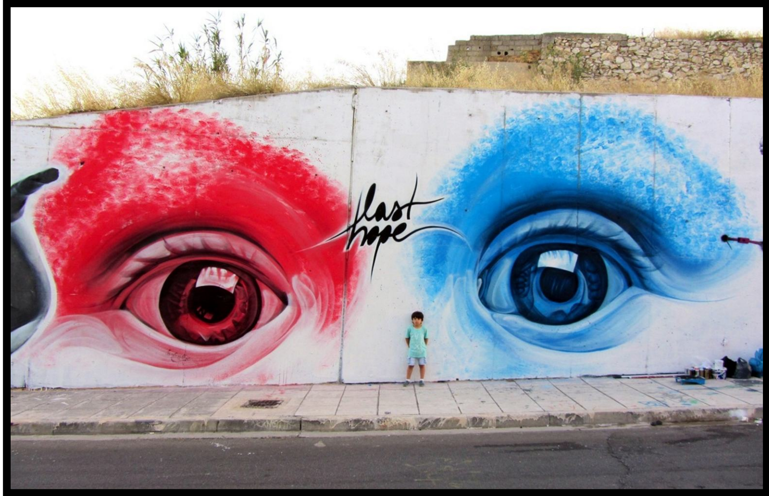
"Last Hope" Street Art by INO