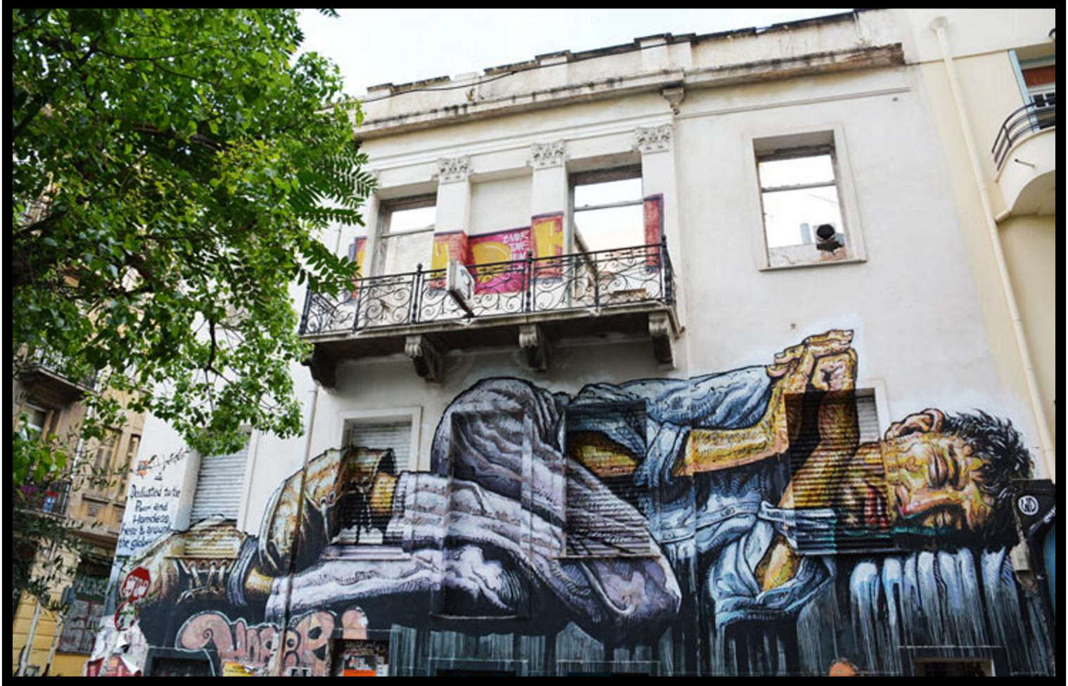
"No Land for the Poor" Street Art by WD (Wild Drawing)