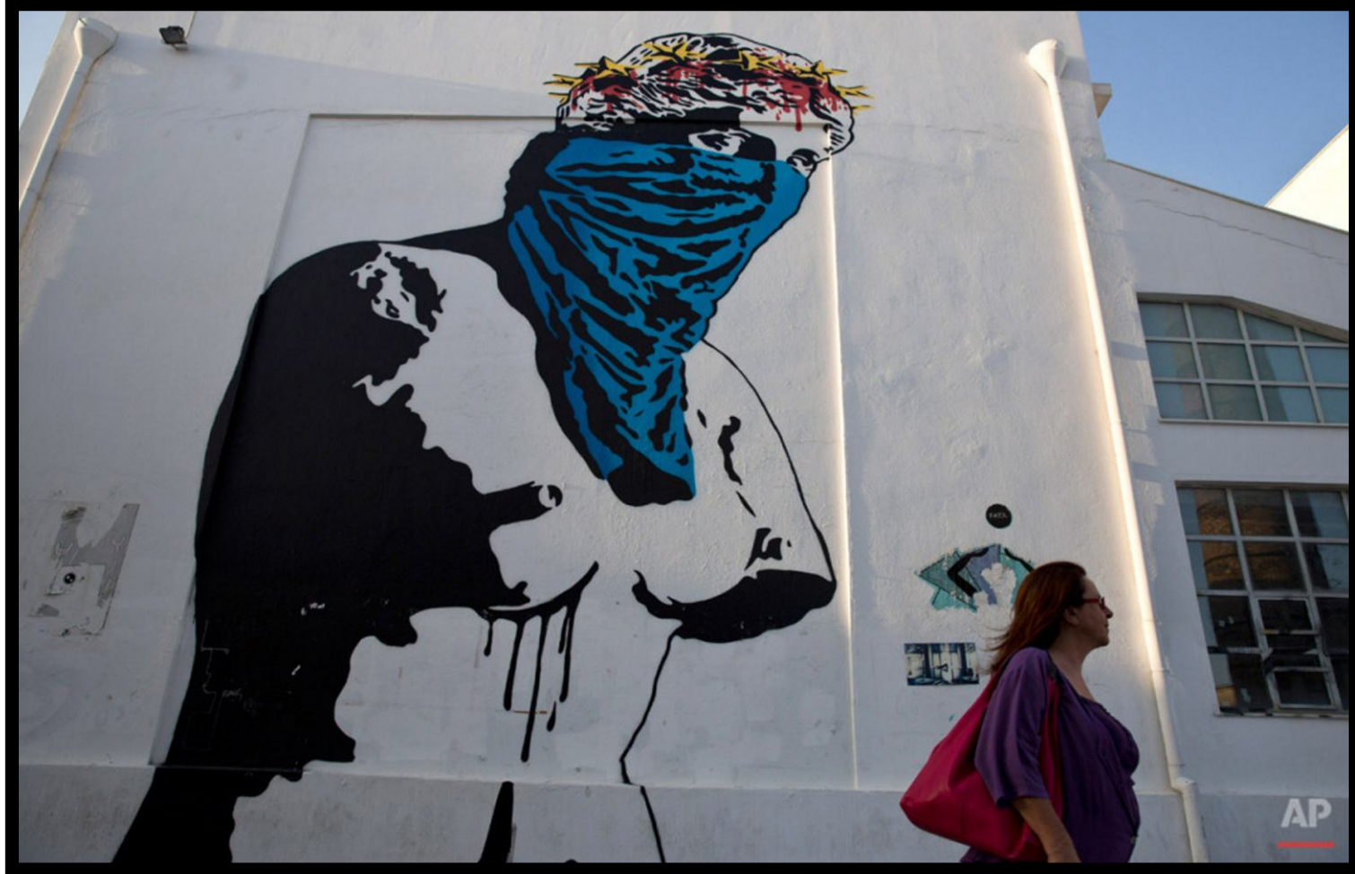
"Venus" Resist vs Submit Street Art by French Artist Goin