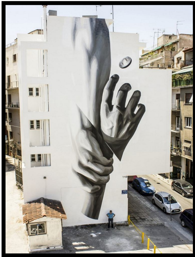
“Wake up” Exarchia district Street Art by INO