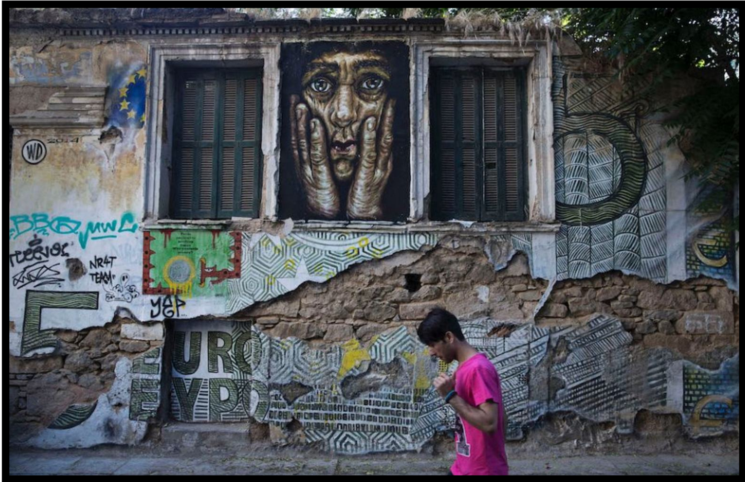
“5 Euros” Exarchia district Street Art by WD (Wild Drawing)