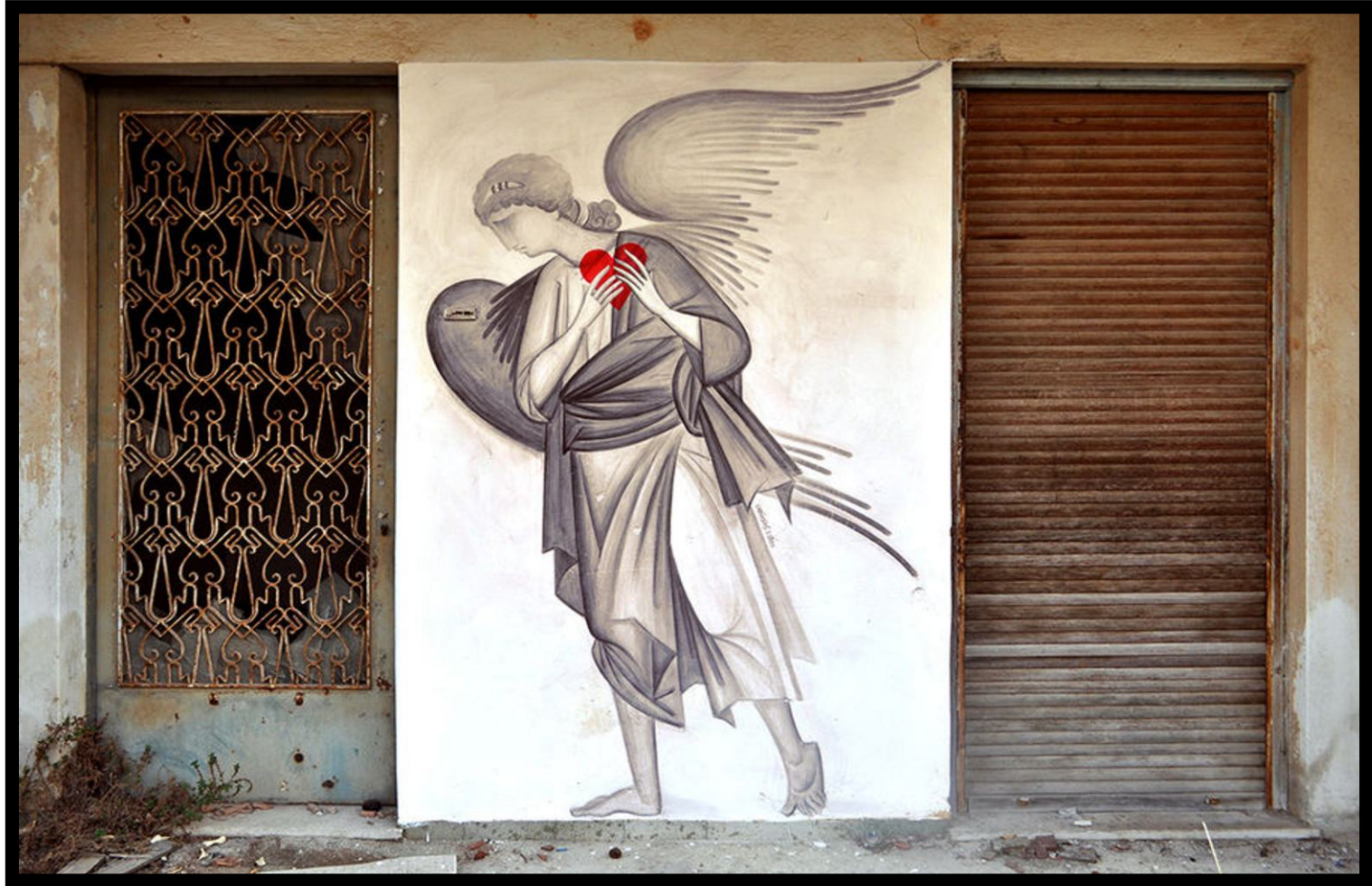
"Wasted love" Street Art by A. Fikos