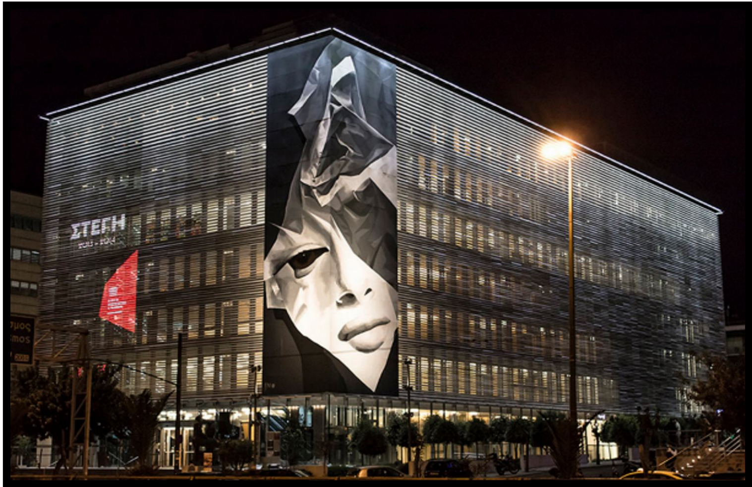
“A female face on crushed paper” Neos Kosmos District, Onassis Cultural Center Street Art by INO