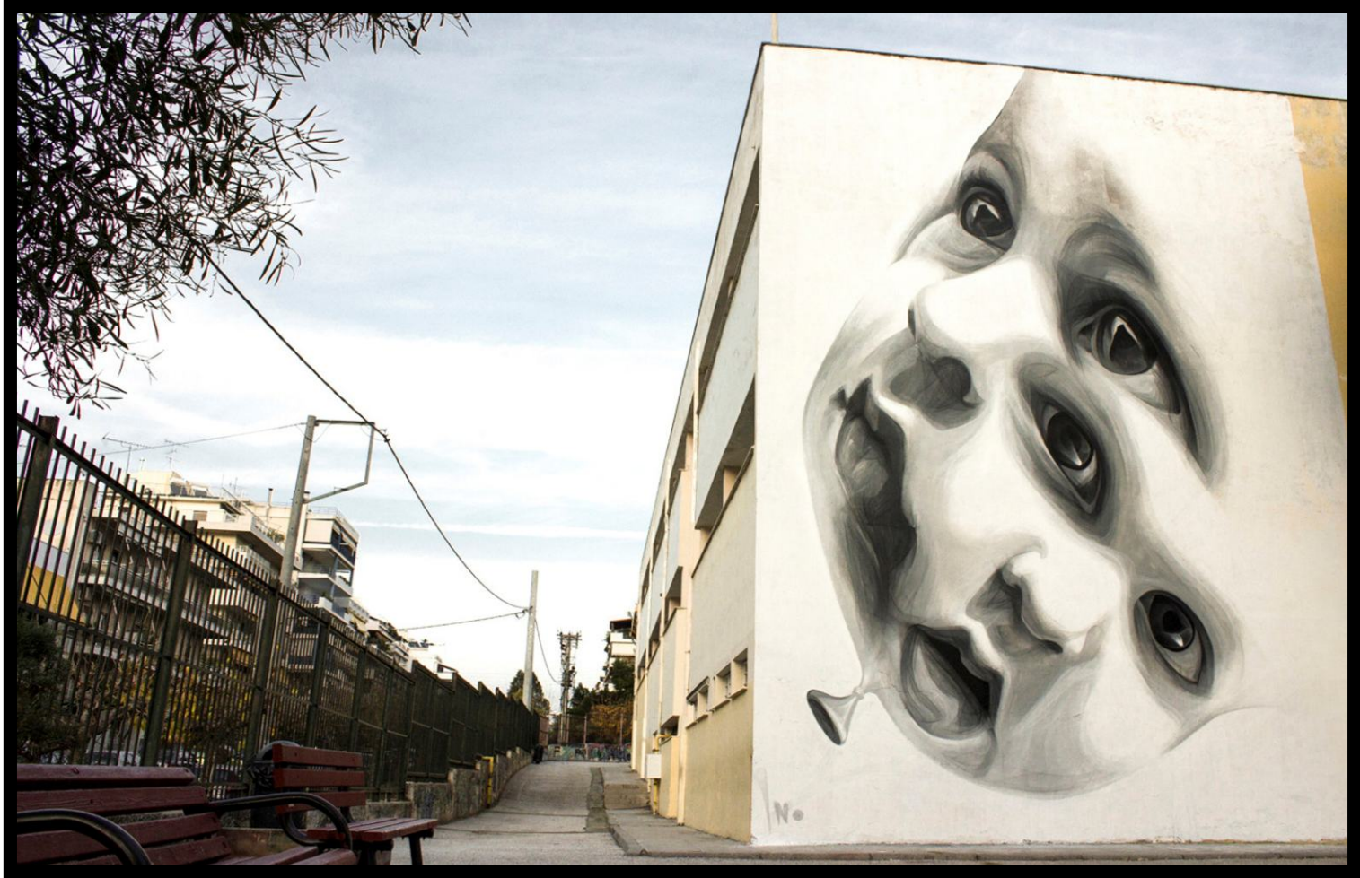
“New future” Street Art by INO