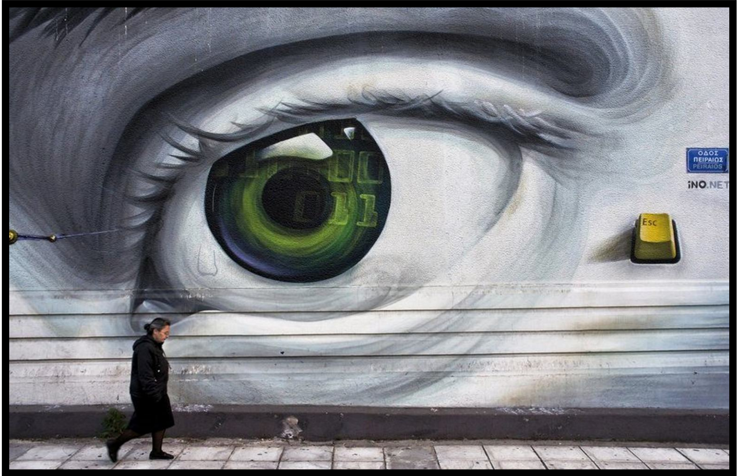
"Access Control" Gazi district Street Art by Iva and INO