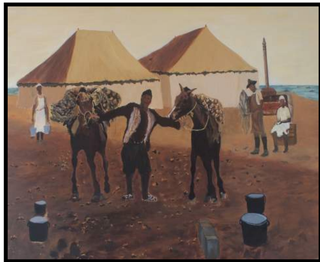
"Refueling the Forces"