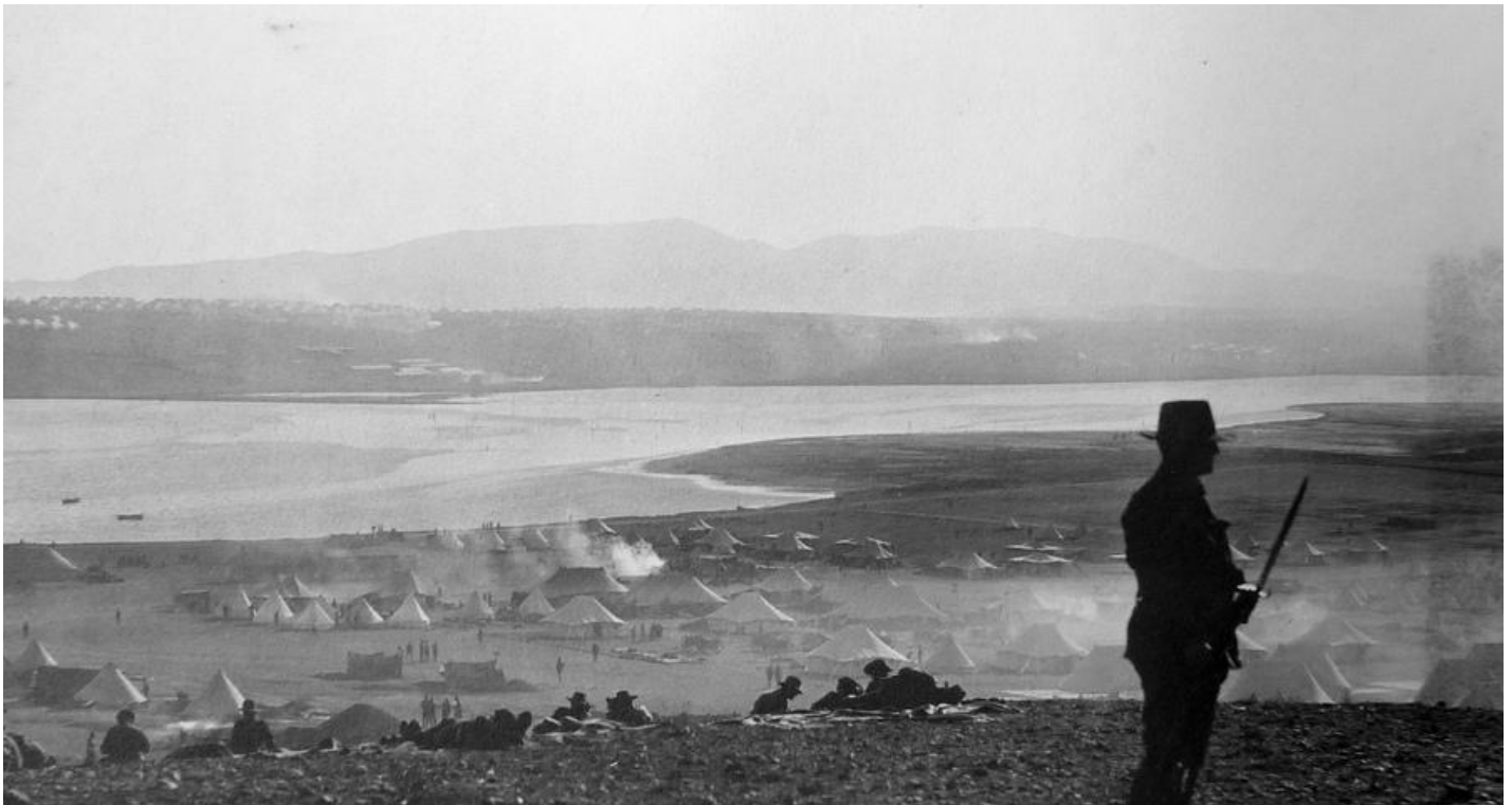
Australian soldiers at Sarpi Rest Camp, West Mudros, 1915

“Lemnos - the Greek dimension in the ANZAC Centenary”