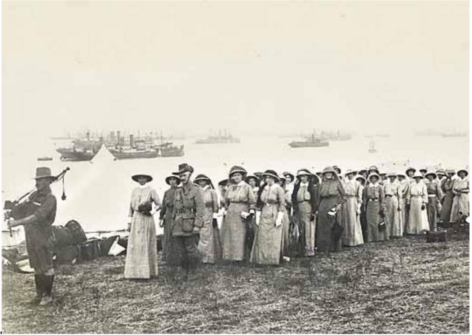
Nurses from No 3 Australian General Hospital marching into their camp at Lemnos, 9th August 1915