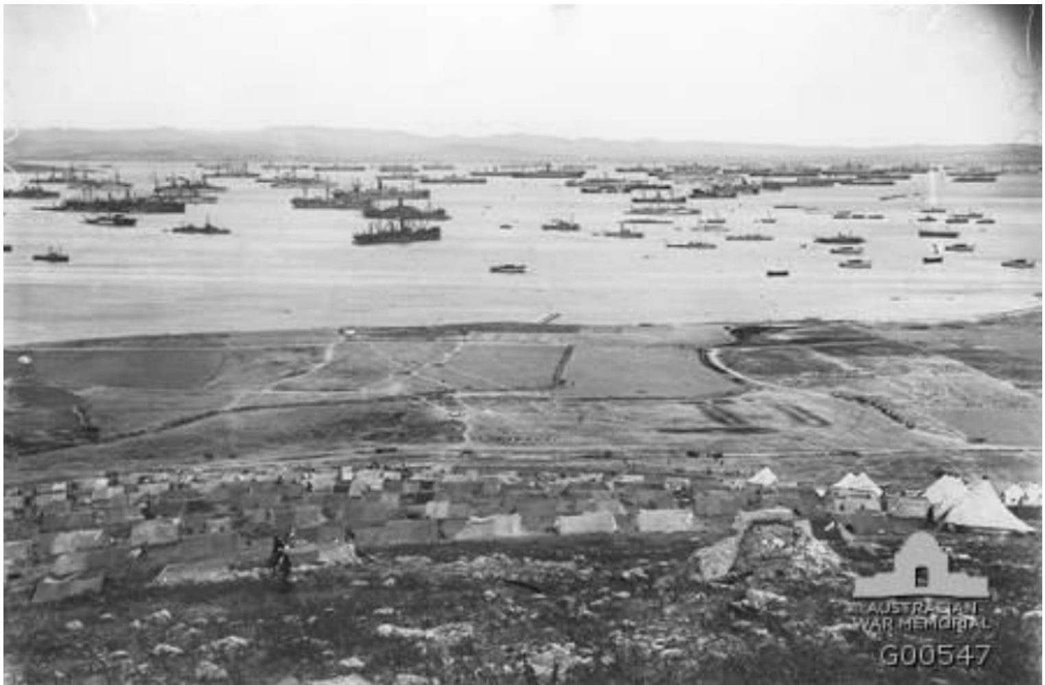
Transports of the Mediterranean Expeditionary Force in Mudros Harbour with a French camp in the foreground (Australian War Memorial Collection G00547)