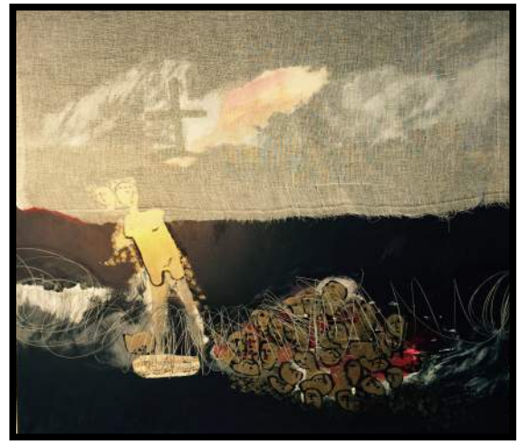
“From the inferno to immortality”

2014 Solo exhibition 'Veils of a Cryptic Message from the Soul' Queen Street Gallery.