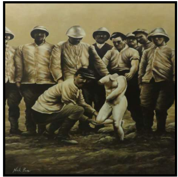
“Allied troops and archaeologists with a headless statue of Eros”

I have developed my own style and technique which is evident in the photorealistic work that I do. I pay particular attention to detail, especially with portraits (working off photography). With my paintings I try to capture light, shadow and emotion which create a realistic image and draw the viewers' attention. Other key elements which I try to capture in my artwork are mysticism, spirituality and sensuality.