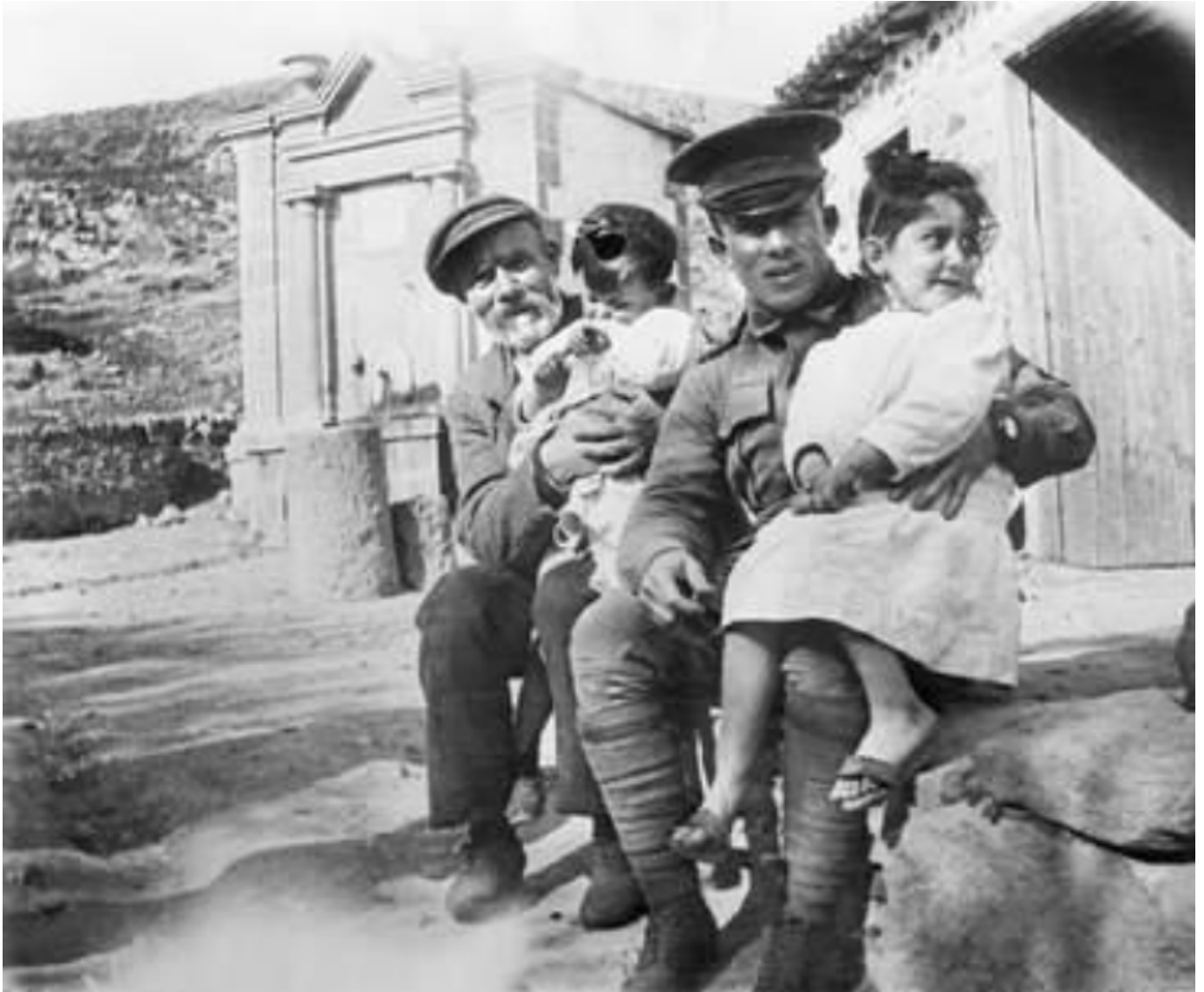
Group portrait of an unidentified Australian Officer with a local Greek family at Therma Springs on Lemnos, 1915