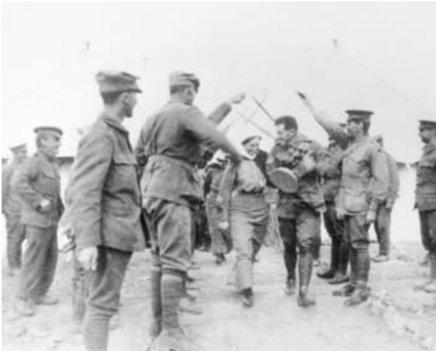
Lemnos - An Anzac Wedding, 1915