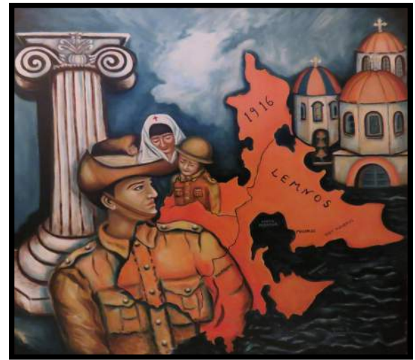
“Hellas pay tribute to ANZACs heroes”

She describes herself as “an adventurer playing with inks and mixed mediums”. Regarding Byzantine icons, she considers iconography as a different approach to art, as if emanating from another different world. She remarks that “it is fascinating once you travel into this world through this magnificent iconography”.