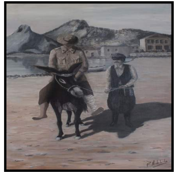
“Moment of tranquility for ANZACS”