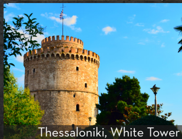
Thessaloniki, White Tower