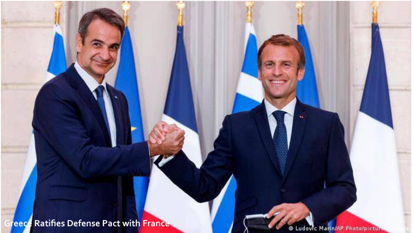
Greece Ratifies Defense Pact with France