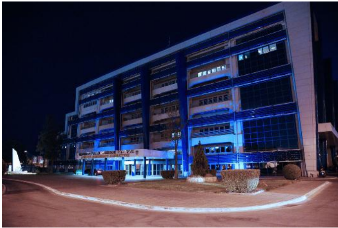
The Ministry of Maritime Affairs and Insular Policy in Piraeus Attica illuminated with maritime blue colour

The Ministry of Maritime Affairs and Insular Policy in Piraeus Attica was illuminated with maritime blue colour, in order to celebrate the World Maritime Day 2021 and to raise awareness of the contribution of shipping and the seafarer's to the world.