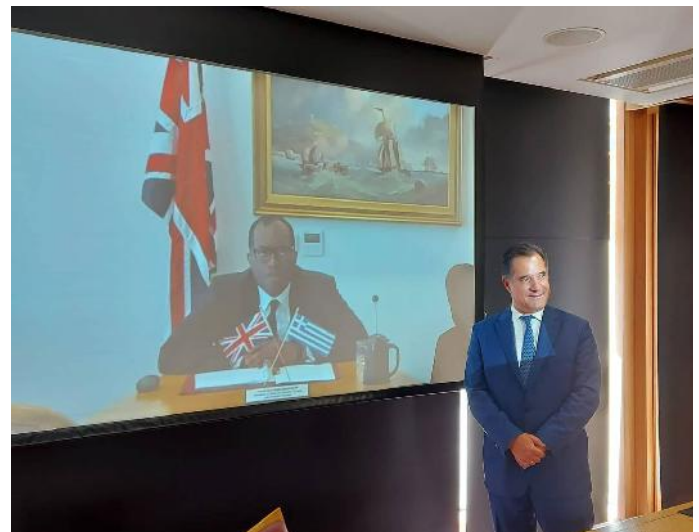
Adonis Georgiadis at the Greek British Symposium, Oxford

Adonis Georgiadis, Minister of Development and Investment visited the UK in order to participate in the 5th Greek British Symposium, that took place in Oxford between 23-25 September. More than 25 speakers along with participants from the UK and Greece engaged on the theme of 'Trade and Exchanges: A New Landscape', particularly during an intriguing first day with a welcome address by Ministers of Business for Greece and the UK, Adonis Georgiadis and Kwasi Kwarteng.