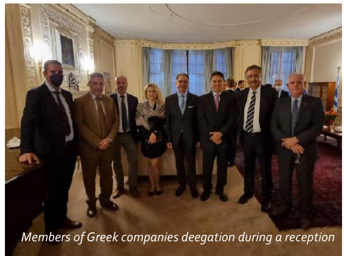
Members of Greek companies delegation during a reception

INTRACOM DEFENSE (IDE) presented its advanced defense products in the areas of Communication & Information Systems, Hybrid Electric Power Systems