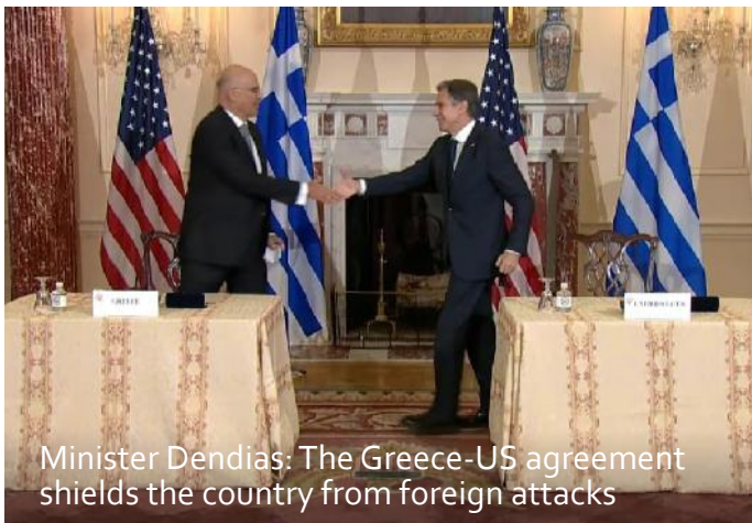
Minister Dendias: The Greece-US agreement shields the country from foreign attacks