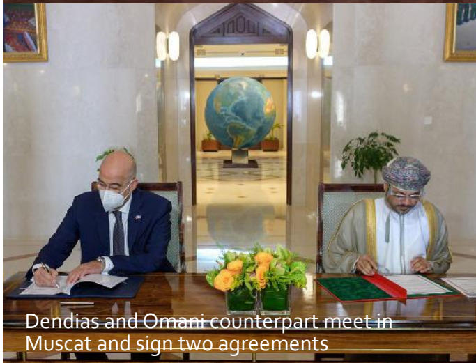
Dendias and Omani counterpart meet in Muscat and sign two agreements