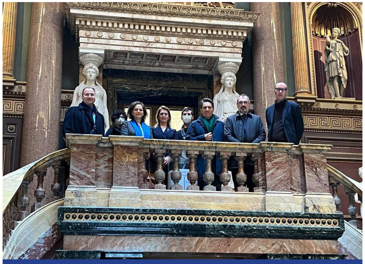
Deputy Minister of Foreign Affairs Mr. Andreas Katsaniotis visited the Fitzwilliam Museum in Cambridge