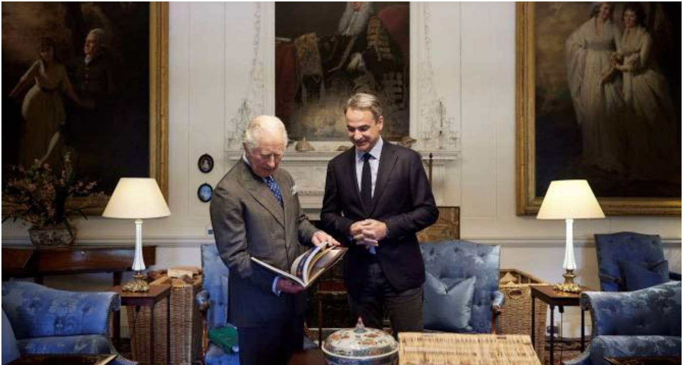
PM Kyriakos Mitsotakis meets with the Prince of Wales, at Dumfries House, in Scotland