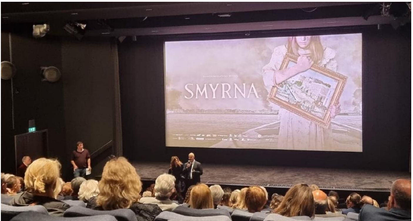
Smyrna UK premiere, exclusive screening on May 31st at BAFTA Theater