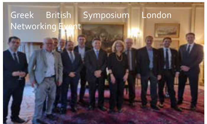
Greek British Symposium London Networking Event