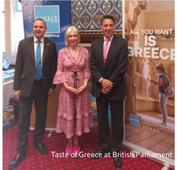
Taste of Greece at British Parliament