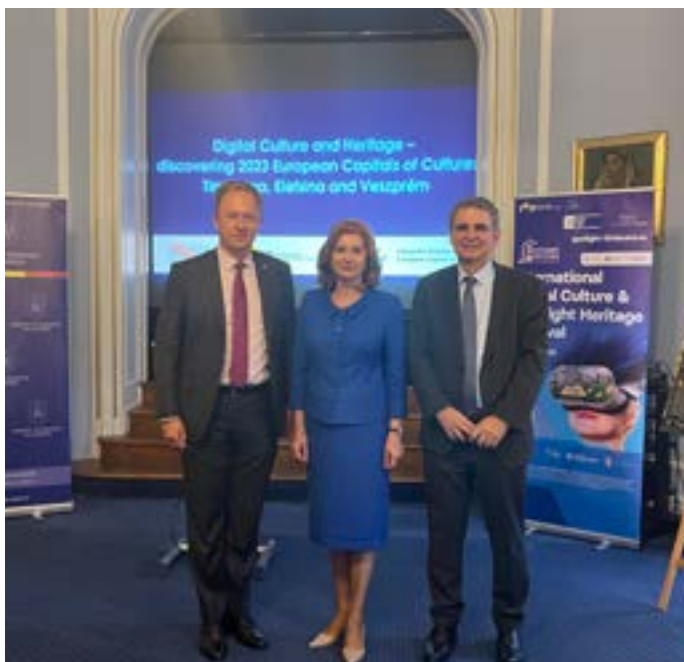
European Capitals of Culture 2023 explore the interplay between culture and technology, 13.09.2023