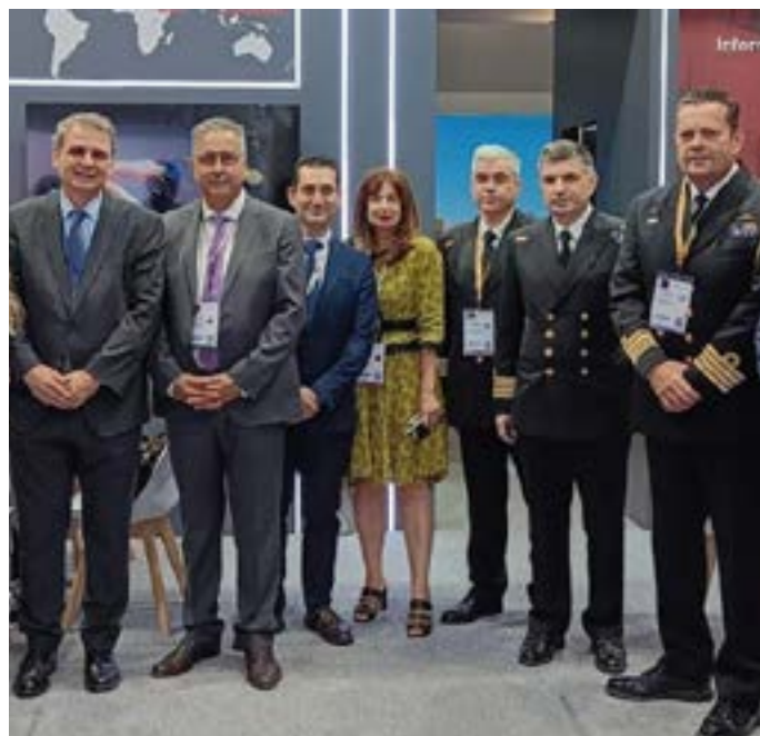
A strong Greek presence at the Defence and Security Equipment International Trade Fair in London, 12-15 .09.2023