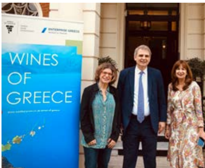
A special Greek wine tasting at the Hellenic Residence in London 26.09.2023