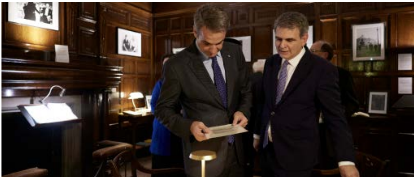
Greek Prime Minister Kyriakos Mitsotakis in London (26-27 November 2023)