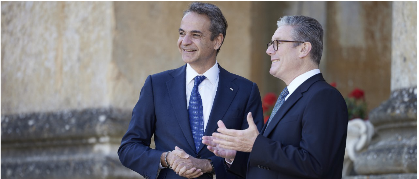
Greek Prime Minister, Kyriakos Mitsotakis at the 4th meeting of the European Political Community, in Blenheim Palace, Oxfordshire, 18 July 2024