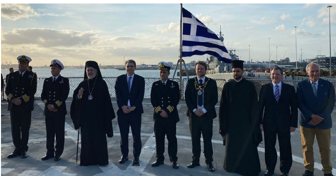
The Greek frigate KANARIS & the HS PROMETHEUS docked in Southampton, as part of the Hellenic Naval Academy's training programme, 4 August 2024