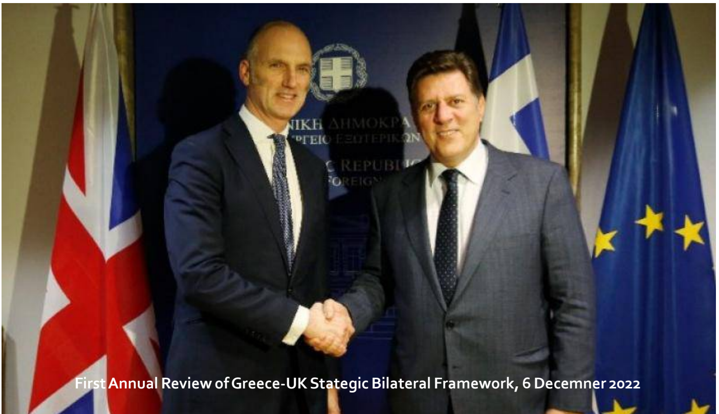
First Annual Review of Greece-UK Strategic Bilateral Framework, 6 December 2022