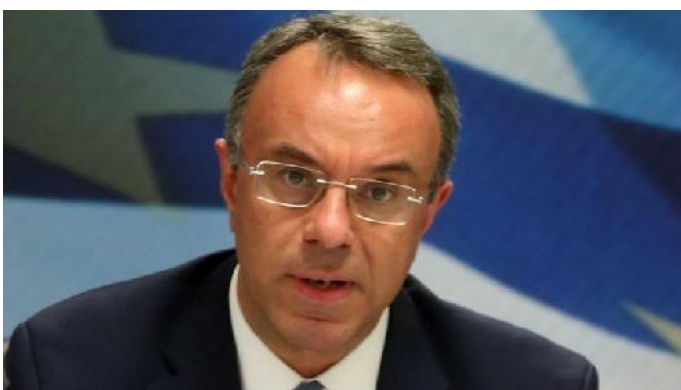
Greek Fin Min Ch. Staikouras Minister of the Year 2023 for Europe by the FT's 'The Banker' magazine