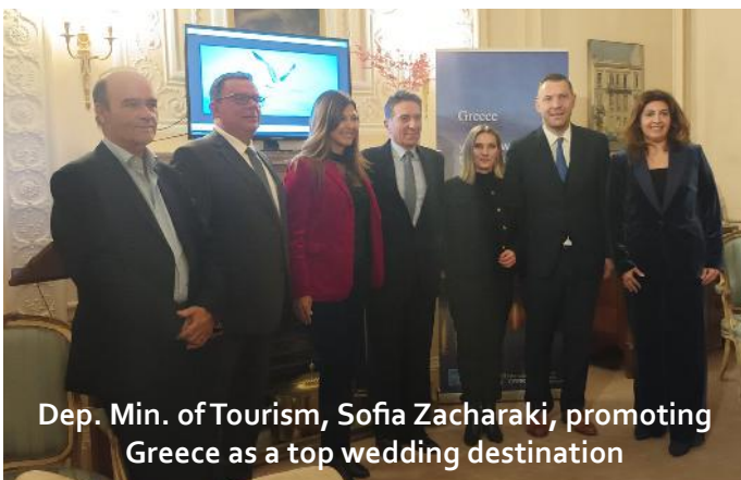
Dep. Min. of Tourism, Sofia Zacharaki, promoting Greece as a top wedding destination