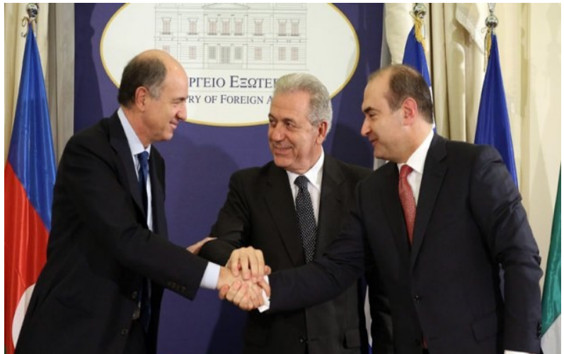
Foreign Minister Dimitris Avramopoulos with the Italian Development Minister Corrado Passera, and the Deputy Prime Minister and Energy Minister of Albania, Edmond Haxhinasto

The Greek government decided to support the establishment of this important foreign direct investment, since it will substantially upgrade Greece's position as an energy hub in Southeast Europe and enhance energy security in the wider region.